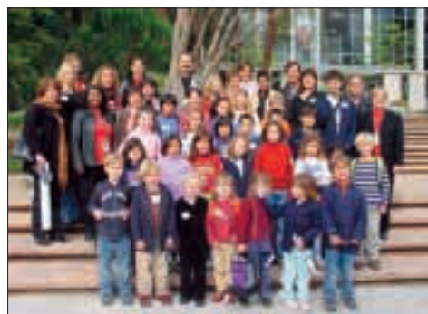
| Figure 2. LILA students, teachers, and parents with members of the JPL Earth Science Public Engagement team during a JPL visit as part of the Earth Science Seminar Series. |

The JPL Ocean Surface Topography Education and Public Outreach team continues to support joint outreach activities and the LILA in its important role as the pilot school for Argonautica in the US.